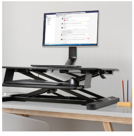
Perfect for Home or Office Use

Includes necessary tools and a pre-installed C-clamp that faces the front of the desk, making installation much simpler, especially in tight spaces (optional grommet mount included). C-clamp fits desks up to 85mm (3.3")thick. Grommet mount fits desks up to 40mm (1.5") thick. Compatible with sit/stand desks.