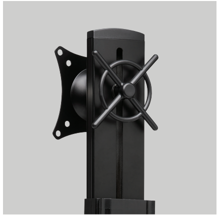
Easy-Grip Adjustment Knob and Quick-Release VESA® Mounts

Unique design allows easy monitor adjustment, even in tight spaces.