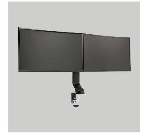
A Single Base Holds Two Monitors

Sleek, sturdy, space-saving design complements a modern aesthetic while keeping your monitors steady and stable (supports monitors up to 27" and up to 8kg / 17.6lbs). Cable management system eliminates cable clutter for a cleaner desktop.