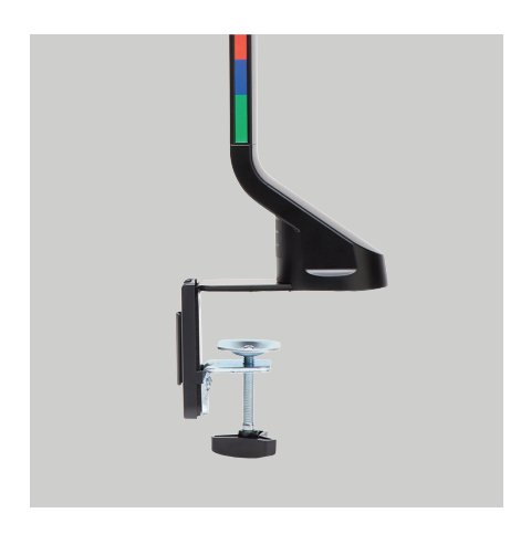
Easy, non-permanent Installation

With SmartFit®, finding the right height for maximum comfort is as easy as 1-2-3. Simply match your hand size to the colour on the provided chart, set the height to your colour and you're done.