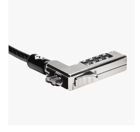
Unique Lock Engagement

Verified and tested for industry-leading standards in torque/pull, foreign implements, lock lifecycle, corrosion, and other environmental conditions. Carbon steel cable resists cutting attempts, and anchors to desks, tables and other attachment points.