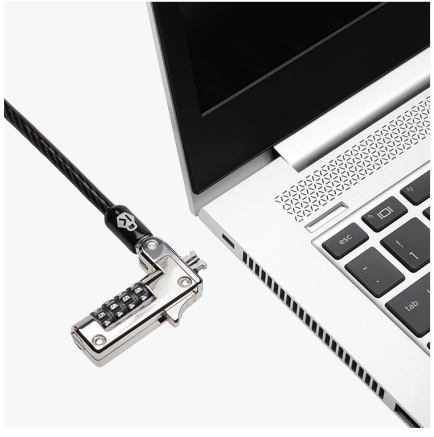
Tough Lock Head and Cable

Slim nano lock head won't raise your device off its surface.