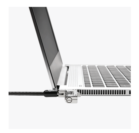
Allows Ultra-Thin and 2-in-1 Laptops to Lie Flat and Stable

Slim NanoSaver™ Combination Laptop Lock (Resettable) – Part Number: K60603WW | UPC Code: 0 85896 60603 1 Slim NanoSaver™ Combination Laptop Lock (Serialized) – Part Number: K60604WW | UPC Code: 0 85896 60404 8 Slim NanoSaver™ Combination Laptop Lock (Serialized 25-pack) – Part Number: K60605WW | UPC Code: 0 85896 60605 5