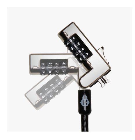
Pivot and Rotate Cable Head Featuring One-Handed Operation

Expanding side "hooks" grab the internal sides of the nano lock slot, creating a strong connection between the device frame and the lock to resist and deter theft.