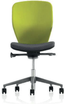
Code. JOY - 01 Swivel Task Chair