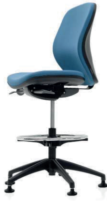
Code. JOY - 03 Counter Chair