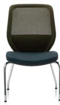
Code. JOY - 15 Mesh Back 4 Leg Chair on Glides