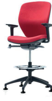
Code. JOY - 04 Counter Arm Chair