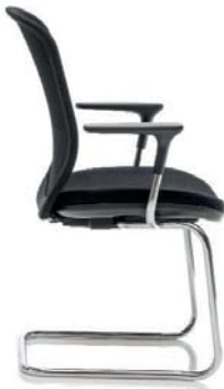
Code. JOY - 14 Mesh Back Cantilever Arm Chair