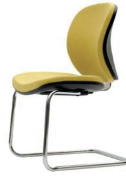
Code. JOY - 05 Visitor Chair