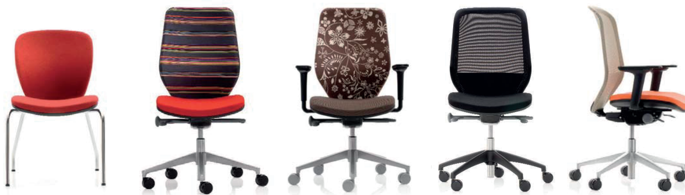
Code. JOY - 07 4 Leg Chair