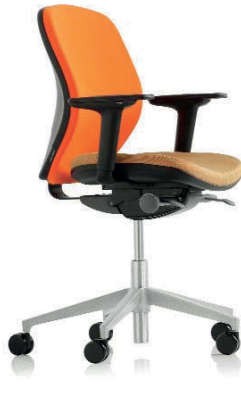
Code. JOY - 02 Swivel Task Arm Chair