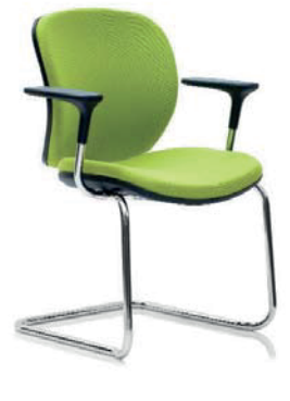
Code. JOY - 06 Visitor Arm Chair