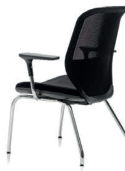
Code. JOY - 16 Mesh Back 4 Leg Arm Chair on Glides