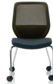
Code. JOY - 17 Mesh Back 4 Leg Chair on Castors