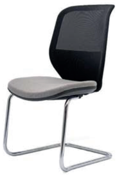
Code. JOY - 13 Mesh Back Cantilever Chair