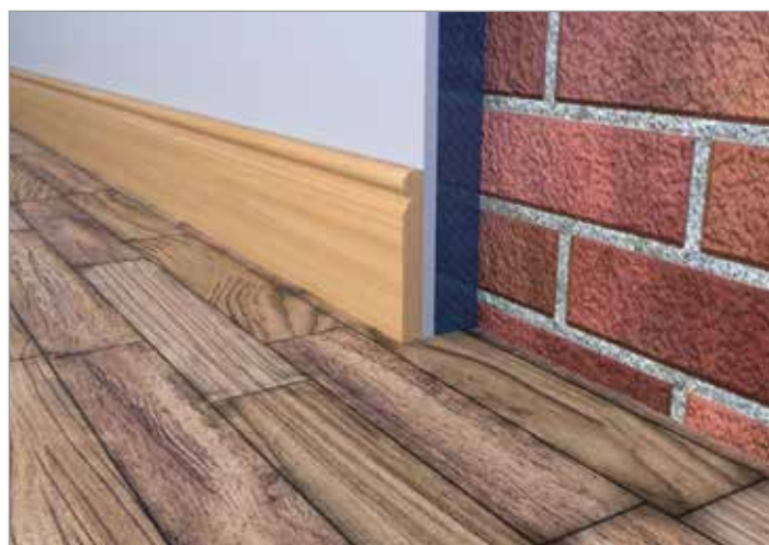
Spacetherm Wallboard skirting detail

For other thicknesses, or for U-value calculations for your project, please contact Technical Services on 01250 872261 or technical@proctorgroup.com