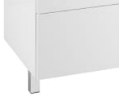
Optional leg set (x2)