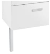
Optional leg set (x2)