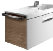
Lateral towel rail for base unit