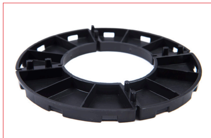
RPS10 - 10mm