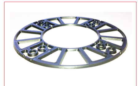
RPS3 - 3mm