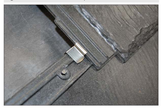
Figure 4 Cambrian slate clips