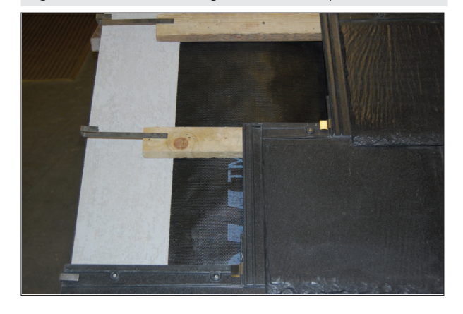
Figure 3 Cambrian verge and slate clips