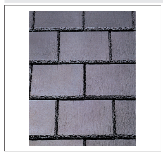
Figure 1 Redland Cambrian Interlocking Slates

1.1 Redland Cambrian Interlocking Slates are manufactured from crushed slate and other fillers, polyester resin and chopped glass fibre strands, mixed to dough, extruded, cut to weight and moulded under pressure and heat. The exposed face is finished by shot-blasting to give the required shade of colour. When installed the product gives the appearance of natural riven slate (see Figure 1).