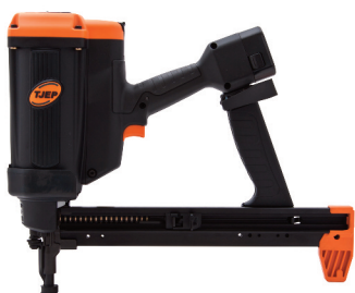
Concrete Nailer TJEP CP-40 2G