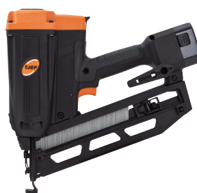
Finisher Nailer TJEP VF 16/64 2G