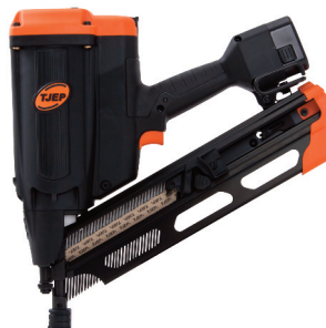
Framing Nailer TJEP GRF 34/90 2G