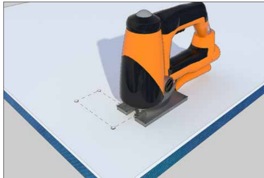
Fig. 3 Making cut-outs in Spacetherm Multi

Cut outs required for pipework or other penetrations, if required, can be made by carefully measuring the location, then drilling the corners and cutting out with a jigsaw in the normal manner.