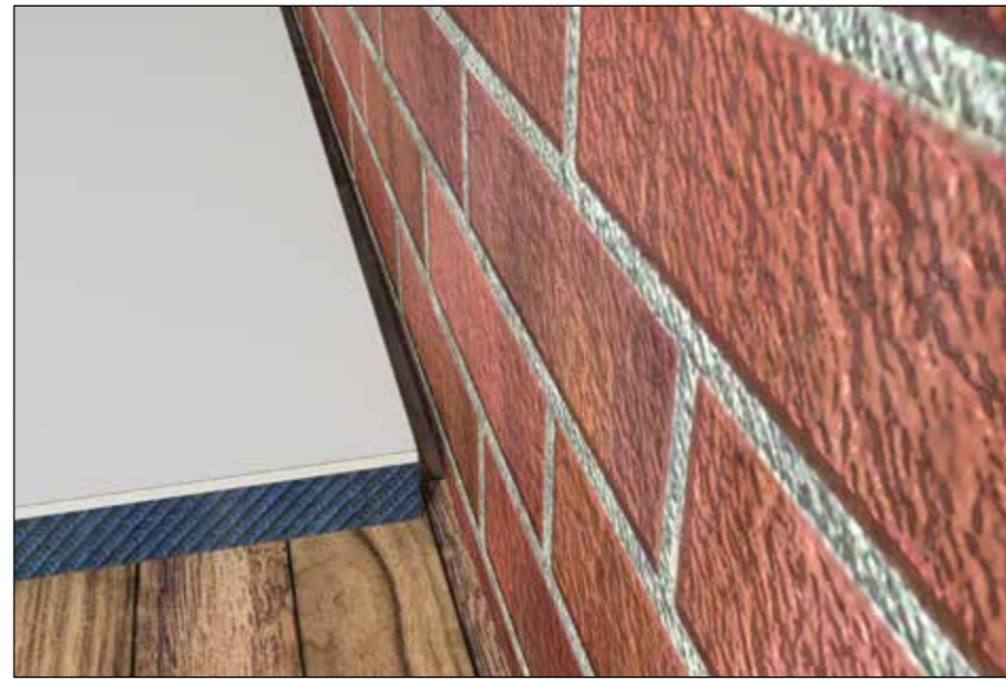
Fig. 6 Expansion gap at perimeter of Spacetherm Multi

Allow for an expansion strip around the perimeter between Spacetherm Multi and the wall or other abutments. The rate of expansion or contraction will depend on the moisture content of the boards, the laying conditions and the length of run. If required, small wedges can be placed between the Spacetherm Multi boards or wall.