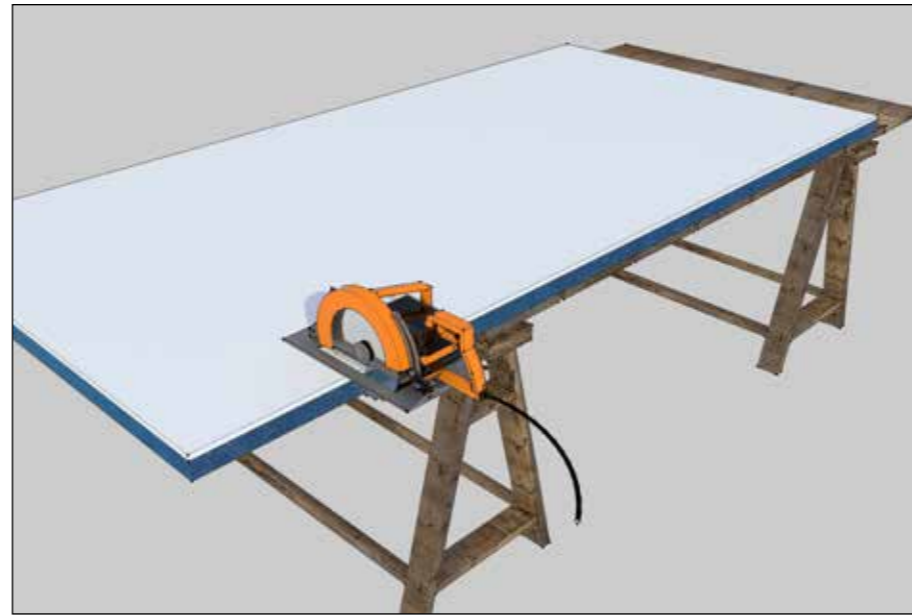
Fig. 2 Cutting Spacetherm Multi Boards

Mechanical cutting is best done with a jigsaw or circular saw, whichever is most appropriate for the type of cut. Before cutting, ensure the board is adequately supported, and cuts should always be made from the internal face of the board (e.g. MgO side).