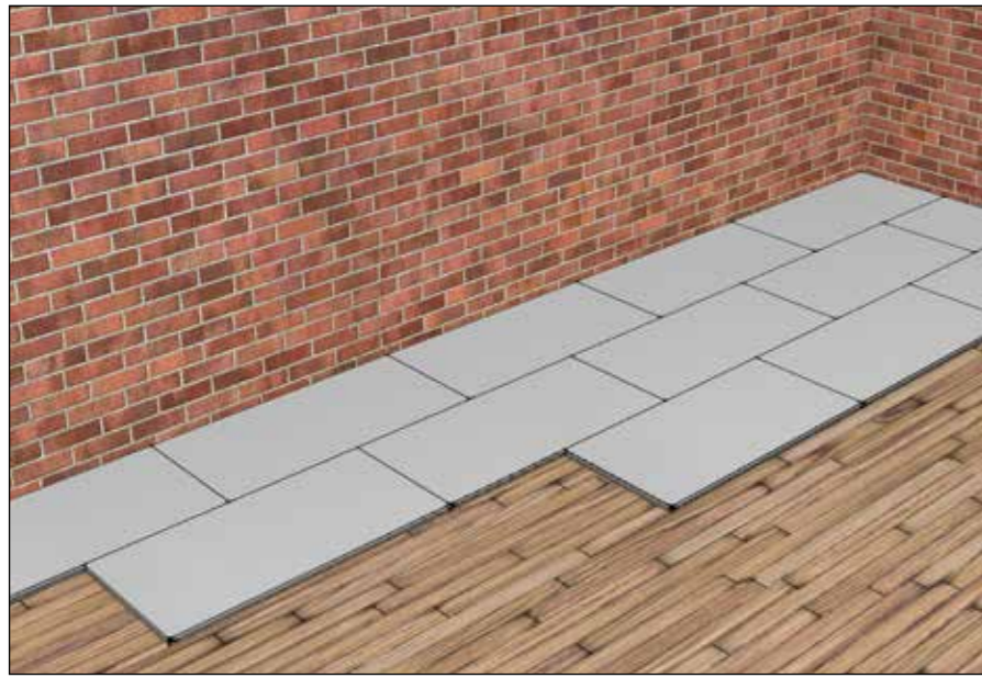
Fig. 4 Board installation pattern for Spacetherm Multi

Spacetherm Multi panels are loose-laid. Mechanical fixings must not be used to fix flooring panels to the underlying subfloor. Use Wraptite Tape to seal butt joints to control dust movement between adjacent panels. Optionally, Wraptite Tape may be used to seal the floor perimeter expansion strip. Surfaces to be taped should be as clean and dust-free as possible.