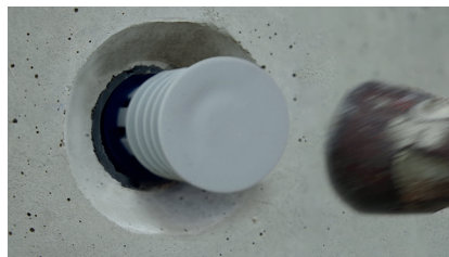
Hammer the Sealing Plug into the formwork spacer