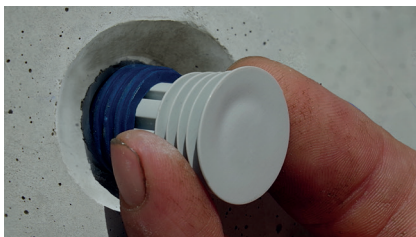
Position the Sealing Plug in the formwork spacer

The Sealing Plug fits in spacers with an inner diameter of 22, 24 or 26mm and can be customized to your specific formwork.