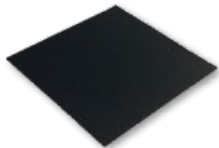
BRSP 3mm rubber shock pad for pedestal base part no: 50.1001