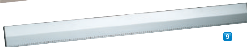
9 PLASTERER'S FEATHEREDGES

Tapered edge for smoothing and straightening plasterwork. Flat edge for tamping and smoothing concrete. Lightweight aluminium. Sold loose.