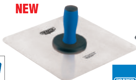
5 PHW SOFT GRIP ALUMINIUM PLASTERERS HAWK

Expert Quality , manufactured from sheet aluminium with a detachable soft grip handle for user comfort and callous protector.