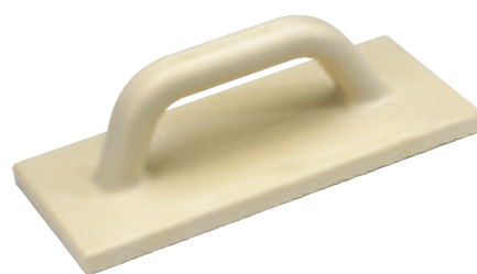
3 T106 POLYURETHANE FLOATS

Lightweight general purpose float manufactured from rigid polyurethane foam. Sold loose.