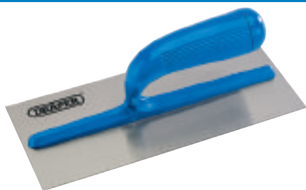
1 T104A GENERAL PURPOSE TROWEL

Polished and lacquered carbon steel blade, fusion welded with five rivets to the moulded polypropylene handle. Display packed.