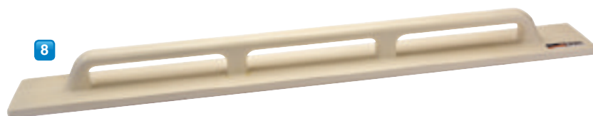
8 PD POLYURETHANE PLASTERER'S DARBY

Made from polyurethane with a raised grip perfect for creating a level finish over a bigger area.