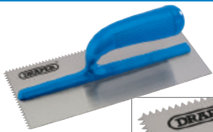
2 T105A ADHESIVE SPREADING TROWEL

Polished and lacquered carbon steel blade, serrated on two edges and fusion welded with five rivets to the moulded polypropylene handle. Display packed.