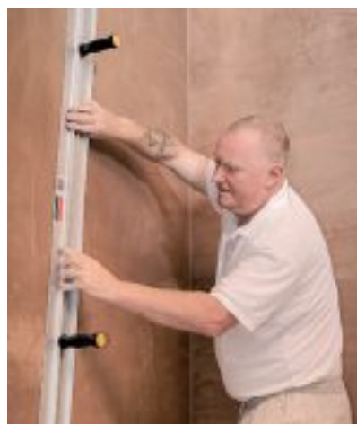
7 AD 1200mm PLASTERER'S DARBY

For final surface finishing. Extruded aluminium with two handles. Sold loose.