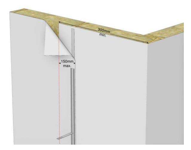
Figure 2 - External corner arrangement

On external corners, the membrane should be taken around corners by at least 300mm (Figure 2).