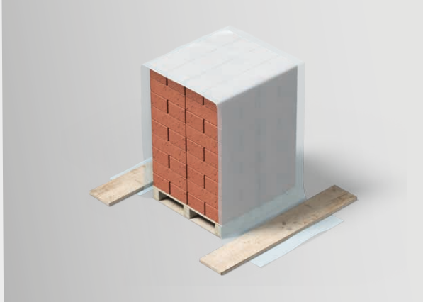
Protect recently constructed brickwork from inclement weather.

Bricks should be stored on a level, free-draining surface that is protected from the elements. Polythene wrapping provides protection from the weather; if this is removed for inspection it needs to be replaced or alternative protection needs to be provided.