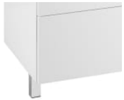
Optional leg set (x2)