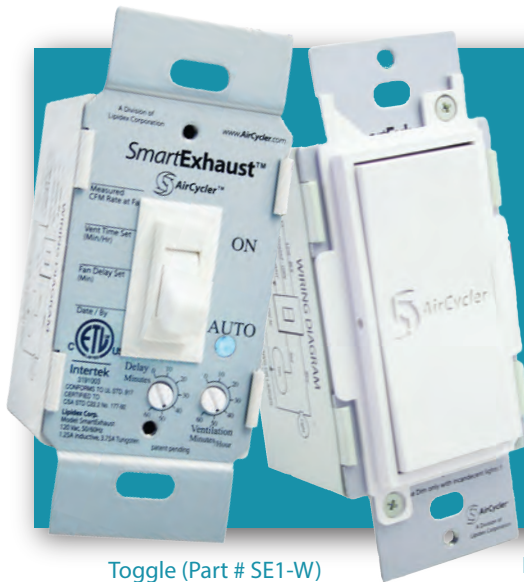
Toggle (Part # SE1-W)

The SmartExhaust™ Bath Fan/Light Switch is a simple and efficient solution for achieving adequate bathroom ventilation and meeting exhaust ventilation requirements. The SmartExhaust™ is designed to replace the bathroom fan and light switches with one smart controller and features programmable settings for running the exhaust fan as much or as little as you want, automatically.