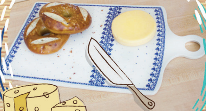
Blue & white CHEESE PLATTER