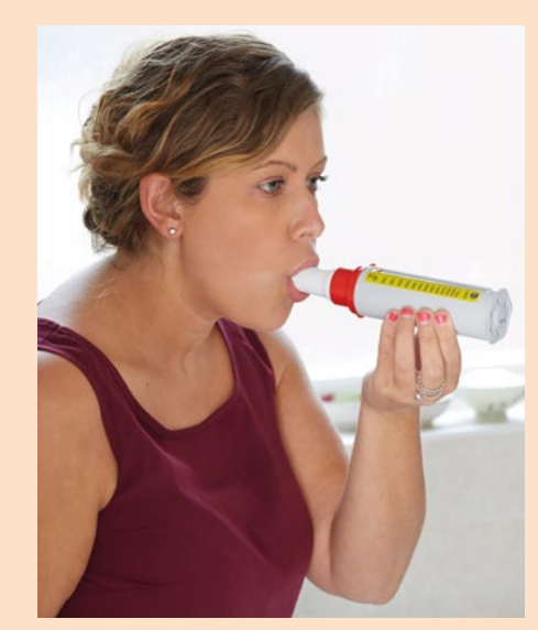
You can get a peak flow meter from your GP, asthma nurse or pharmacy