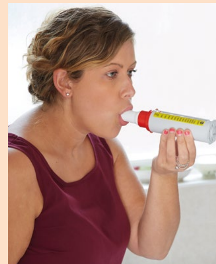
You can get a peak flow meter from your GP, asthma nurse or pharmacy