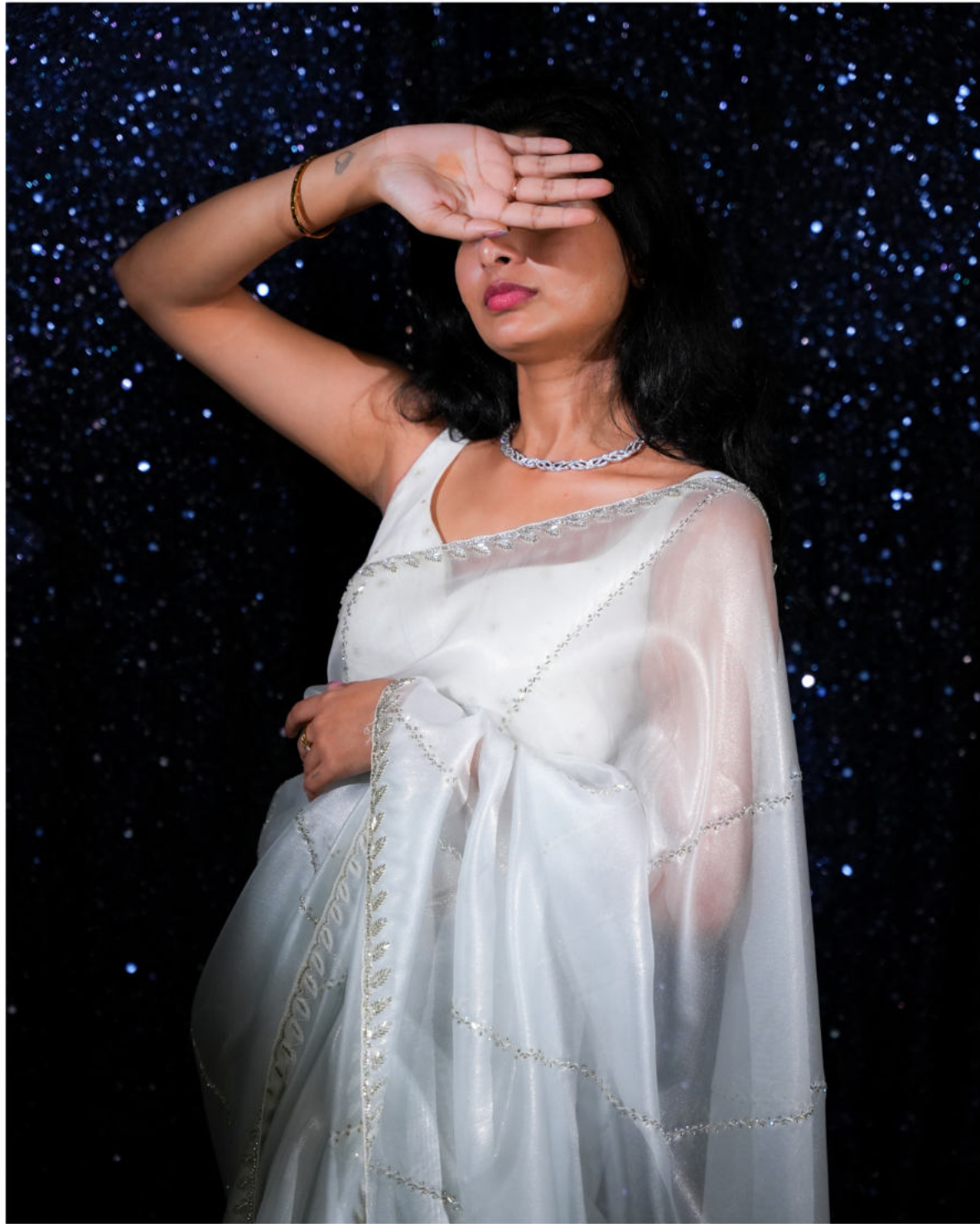
Sangeet - Shimmery Girl (2023)