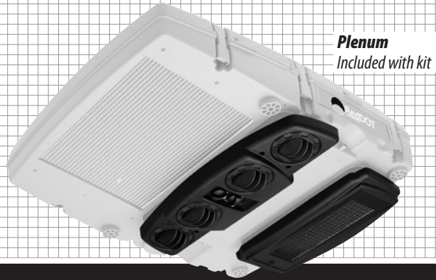
Plenum Included with kit