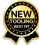
CS07-691 - Radiator Core Support 1969-72 GMC P/U (GMC Only)