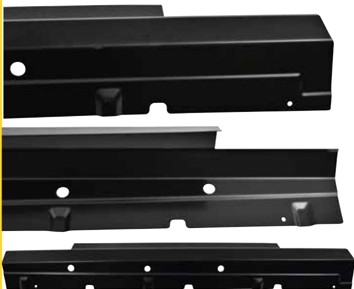
RP16-07SL - Slip-On Rocker Panel with Sills (1.2 MM) - Drivers 2007-13 Silverado/Sierra P/U Std. Cab