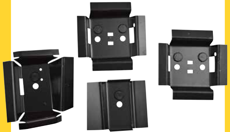
SB12-78BS - Seat Mounting Bracket Set for Bench to Bucket Seat Conversion, 4 Pcs 1978-87 El Camino/Caballero/ Regal/Grand Prix; 1978-81 Grand Am/Lemans; 1978-83 Malibu