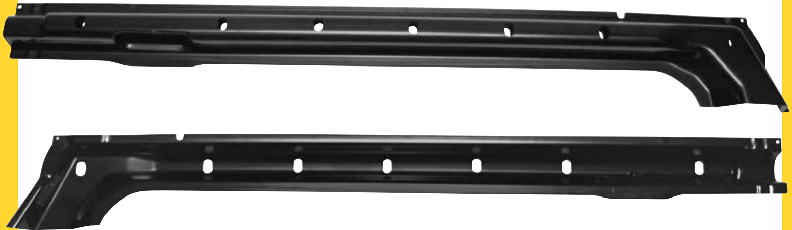
RP14-982L - Inner Rocker Panel (1.6MM) - Drivers 1998-02 Dodge P/U Quad Cab 4dr

MOPAR NEW PRODUCT RELEASE • NOVEMBER 2023