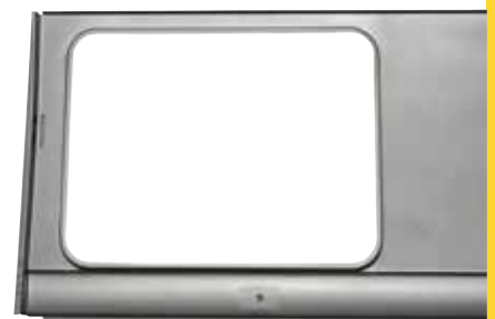
QP31-551UR - Upper Side Panel Window Panel Outer Skin, 1 Window Only - Passenger 1955-67 T1 (Lhd)