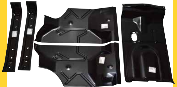
TF03-738S - Trunk Floor with Brackets & Gas Tank Braces, 8 Pcs Set 1973-77 GM A-Body