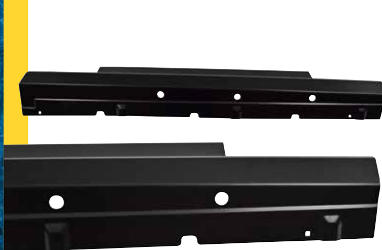
RP16-07SR - Slip-On Rocker Panel with Sills (1.2 MM) - Passenger 2007-13 Silverado/Sierra P/U Std. Cab