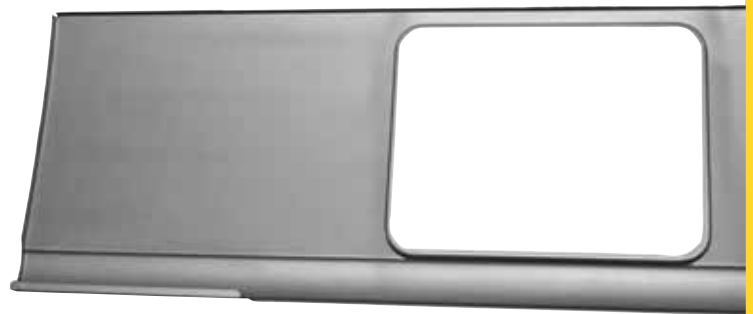
QP31-553UL - Complete Upper Side Panel (3 Pop Out Windows), Weld Thru Primer - Drivers 1955-67 T1 (Lhd)