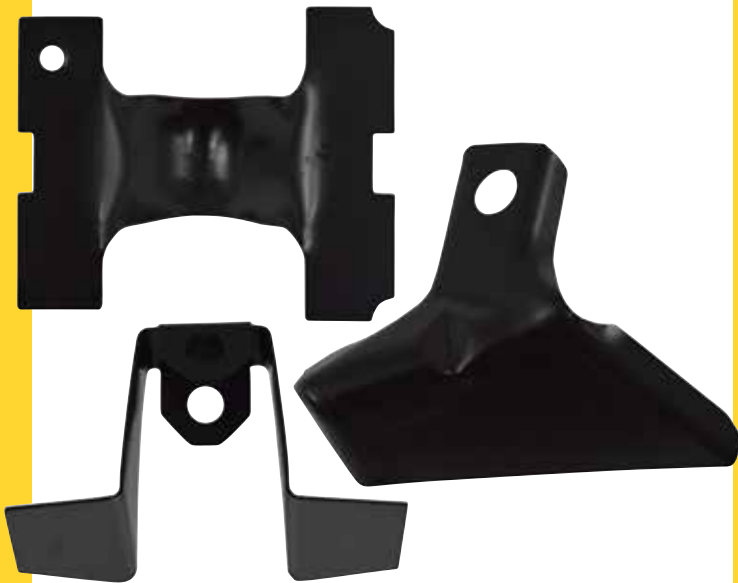
TF03-73BS - Trunk Floor Bracket Set, 3 Pcs 1973-77 GM A-Body