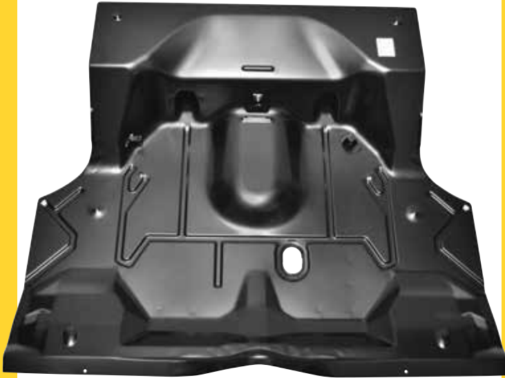
TF03-73 - Trunk Floor - Complete with Braces 1973-77 GM A-Body