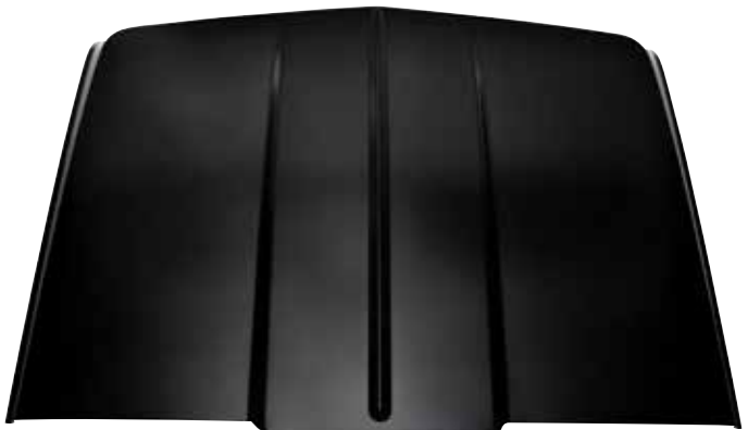
H007-691 - Cowl Hood, Steel, without Emblem Hole 1969-72 C10/Blazer, 1970-72 Jimmy