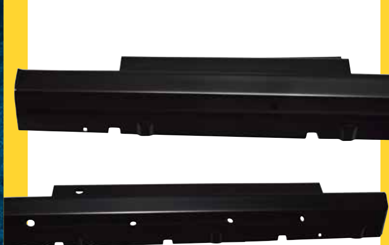
RP16-07SCR - Slip-On Rocker Panel with Sills (1.2 MM) - Passenger 2007-13 Silverado/Sierra P/U Crew Cab