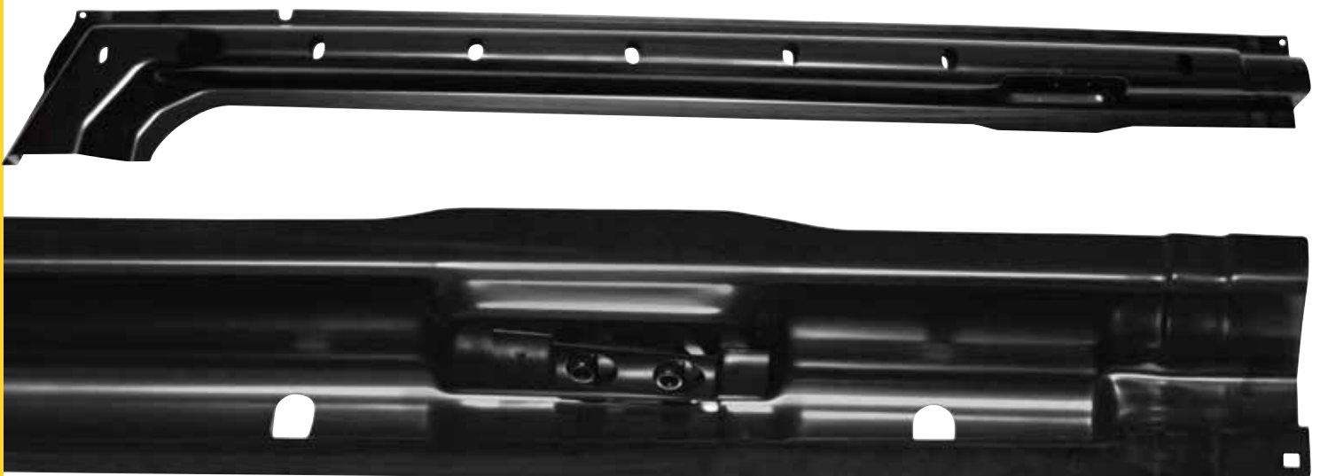
RP14-982R - Inner Rocker Panel (1.6MM) - Passenger 1998-02 Dodge P/U Quad Cab 4dr