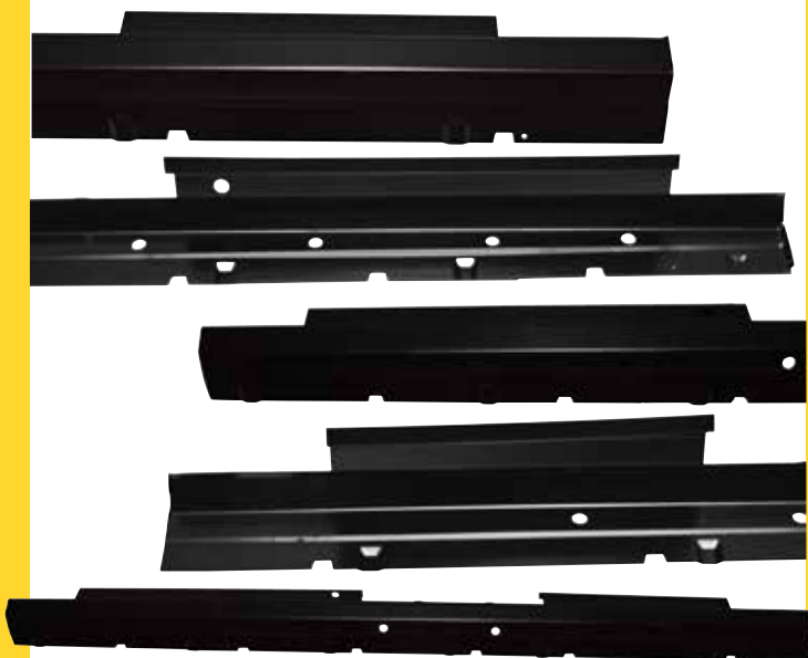
RP16-07SCL - Slip-On Rocker Panel with Sills (1.2 MM) - Drivers 2007-13 Silverado/Sierra P/U Crew Cab