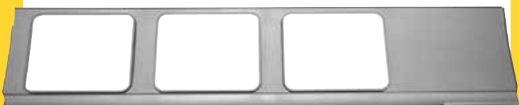
QP31-553UR - Complete Upper Side Panel (3 Pop Out Windows), Weld Thru Primer - Passenger 1955-67 T1 (Lhd)