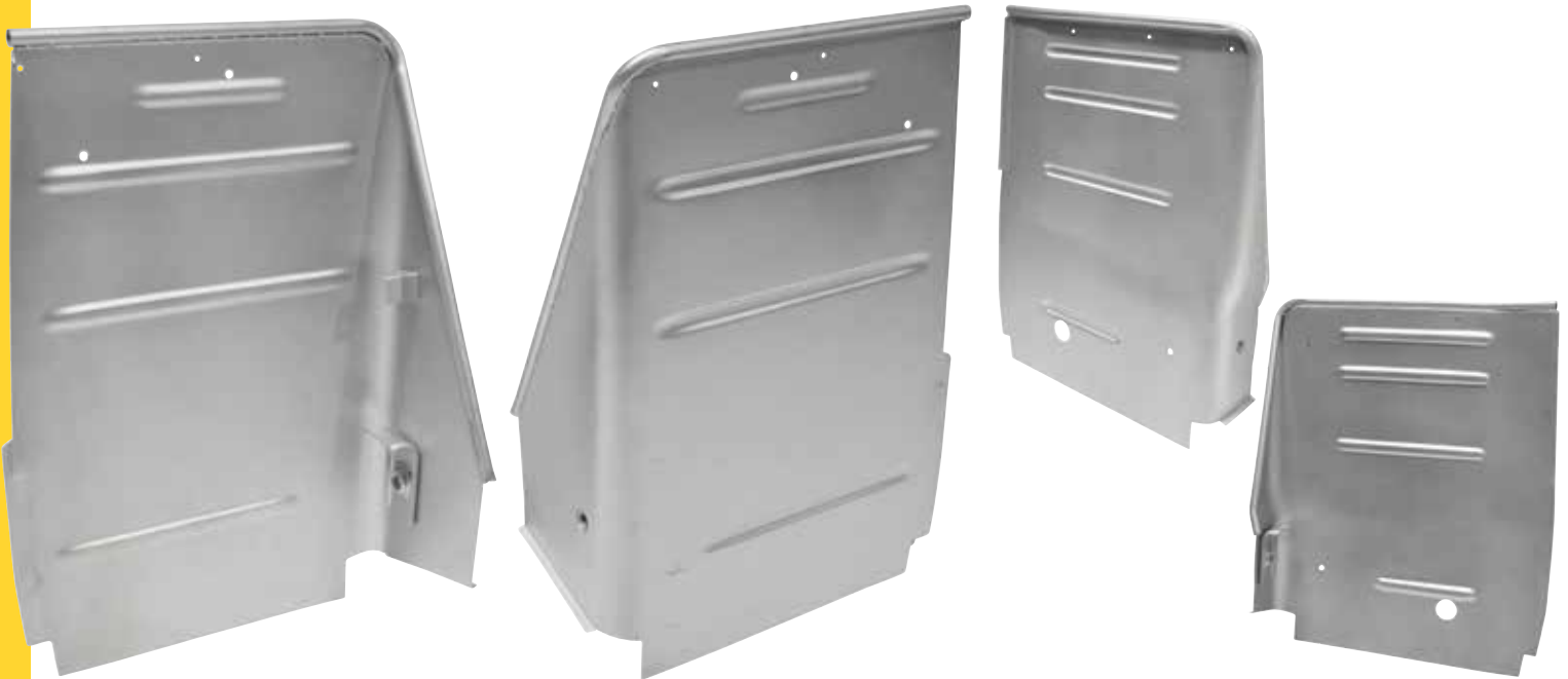
SB31-63WB - Walk Through Bulkhead Lh+Rh (Weld Thru Primer) 1963-67 T1