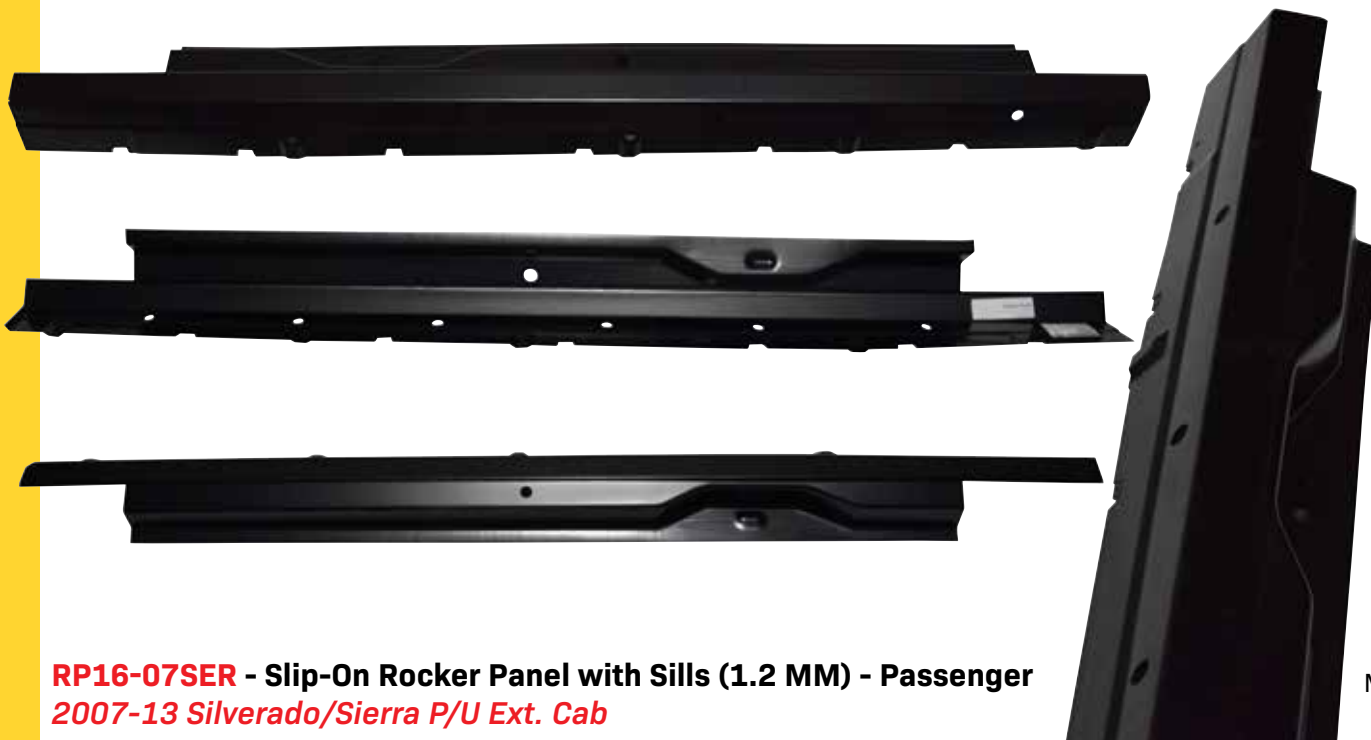
RP16-07SER - Slip-On Rocker Panel with Sills (1.2 MM) - Passenger 2007-13 Silverado/Sierra P/U Ext. Cab