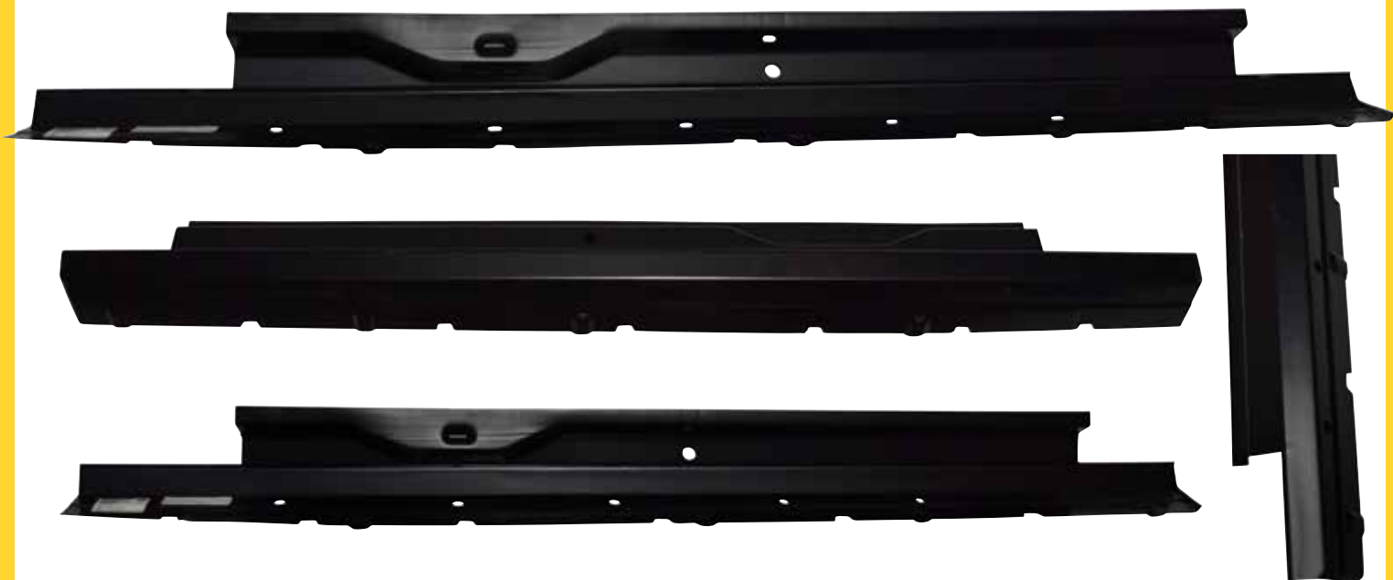
RP16-07SEL - Slip-On Rocker Panel with Sills (1.2 MM) - Drivers 2007-13 Silverado/Sierra P/U Ext. Cab