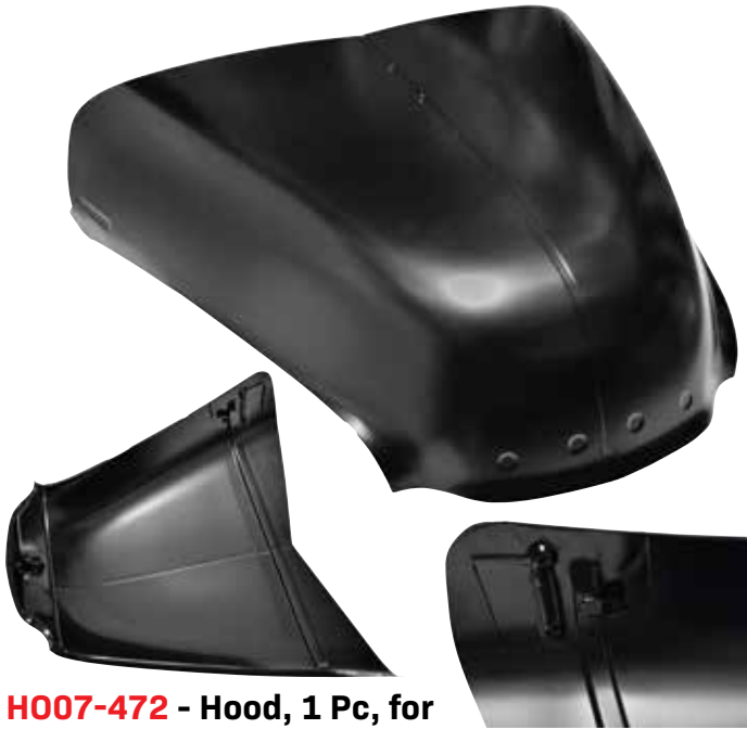
H007-472 - Hood, 1 Pc, for Factory Moulding 1947-54 C10 P/U