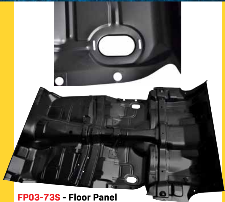
FP03-73S - Floor Panel Assembly with Toe Board 1973-77 GM A-Body