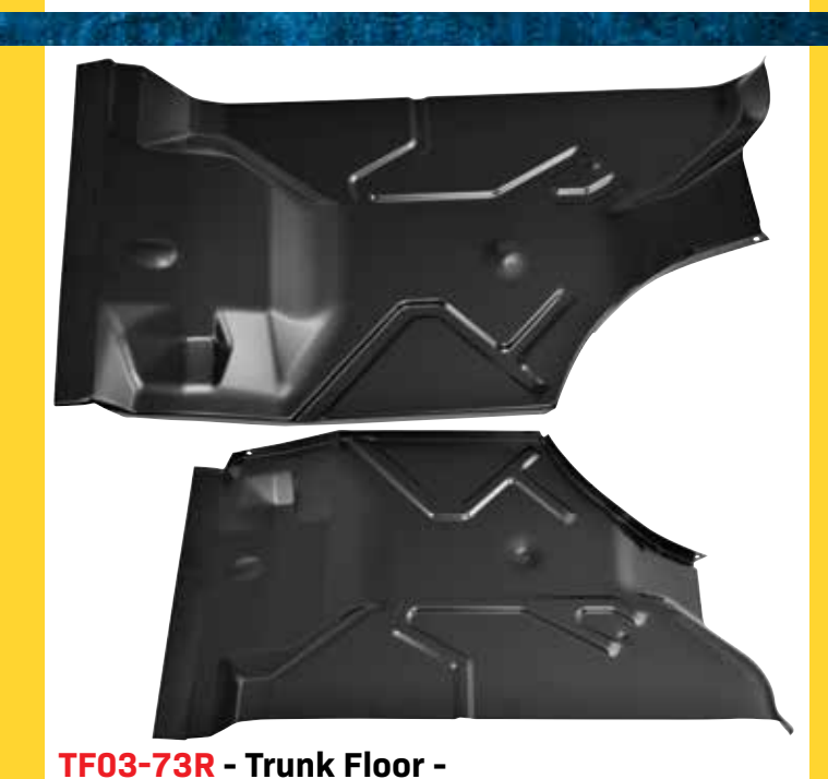
Passenger 1973-77 GM A-Body

TF03-73L - Trunk Floor - Drivers MSRP $129.95 1973-77 GM A-Body MAP $109.95