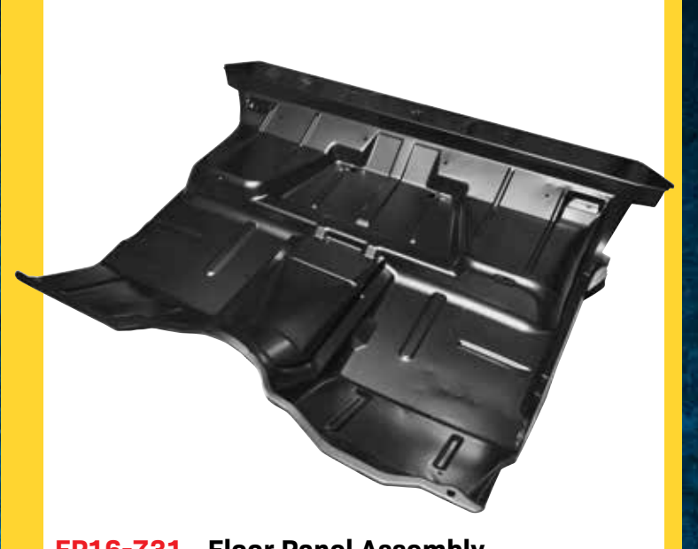
FP16-731 - Floor Panel Assembly Low Hump 1973-87 Chevy/GMC Pickup