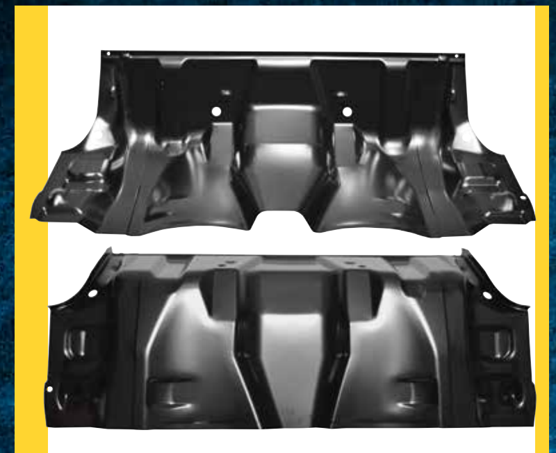
FP03-73SP - Rear Seat Floor Pan (Full Size) 1973-77 GM A-Body