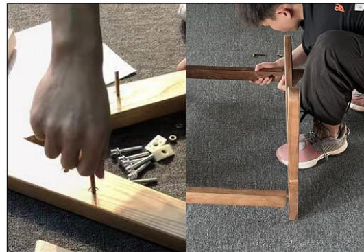
Step 4: Install the other foot and lock the screw as in the previous step