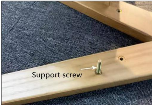
Step 1: Tighten the support screws