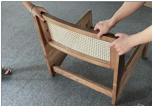
Step 3: Install the backrest, use hexagonal screws + small spring washers + small washers for the backrest