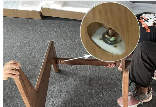
Step 2: Put in the plastic spacer with the inclined position facing up Put in the gasket and lock the nut