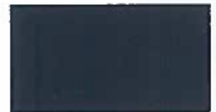
Midnight Blue PREMIUM COLOR