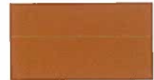
Copper Canyon PREMIUM COLOR

All colors are intended only as an approximation of the actual color. Color chips are available upon request.