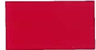
Brite Red PREMIUM COLOR