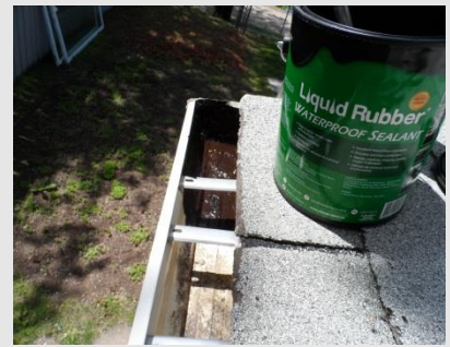
2 ND COAT