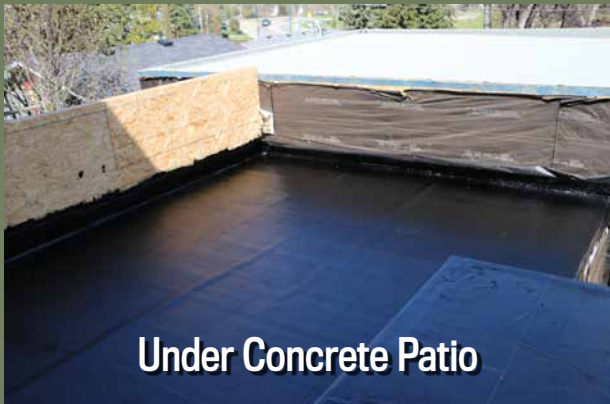
Under Concrete Patio