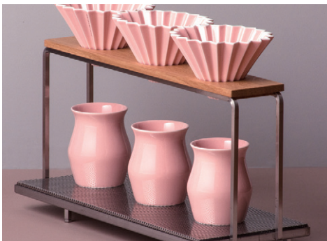
Maximizes coffee aroma

The barista's "sense" are maximized by cutting out the decorative and playful elements and maximizing functionality. This product is suitable not only as a daily barista's tool, but also for special situations such as competitions.