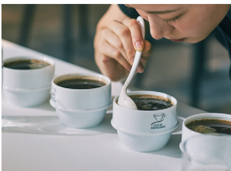
More uniform and accurate tasting thanks to advanced manufacturing techniques