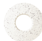
WHITE SPLASH BLACK