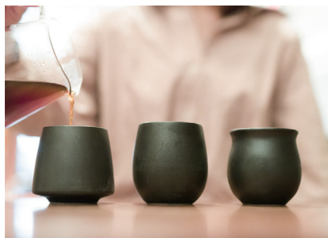
Unprecedented coffee aroma experience with a meticulously calculated shape