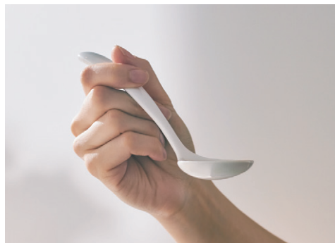
Maximize the accuracy of cupping