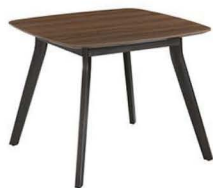
PX9 S100 Square Meeting Table L1000 * W1000 * H750mm