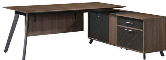
PX9 1890 (L/R) Executive Table with Side Cabinet (Left/Right) Table = L1800 * W900 * H750mm Side Table = L1600 * W550 * H655mm L1930 * W1800 * H750mm