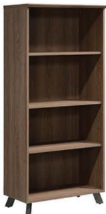
PX9 HC O1650 High Open Cabinet L800 * W450 * H1650mm