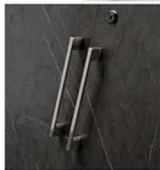
Elegant Metal Handle