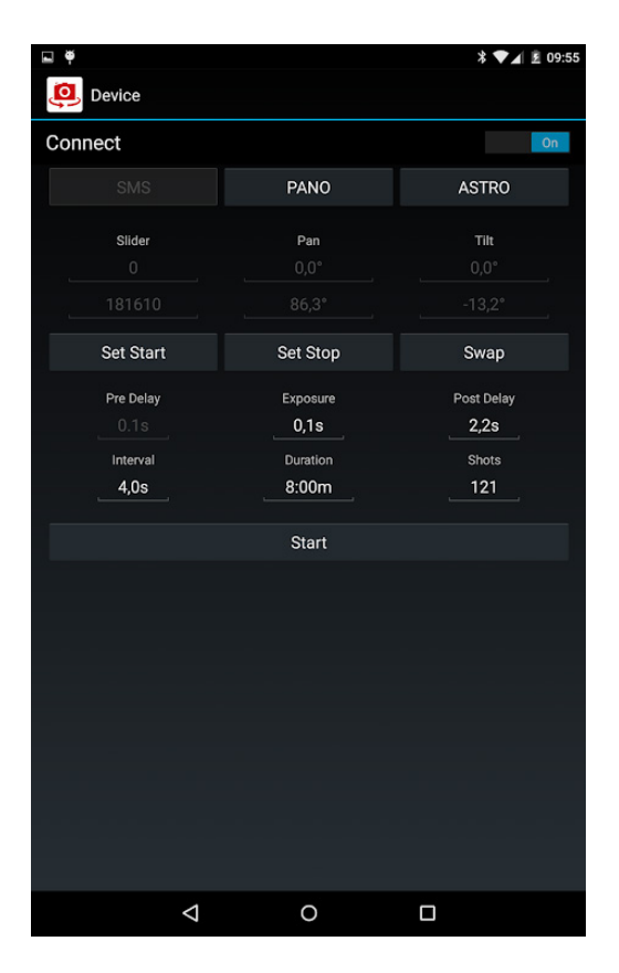
Select the delay, exposure, interval, duration and number of shots.