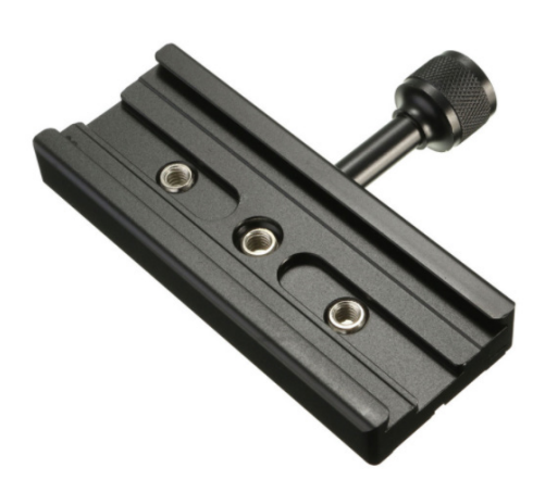
You may need to mount the QR-120 plate to the L-Bracket on the Tilt Unit to counterbalance the camera.