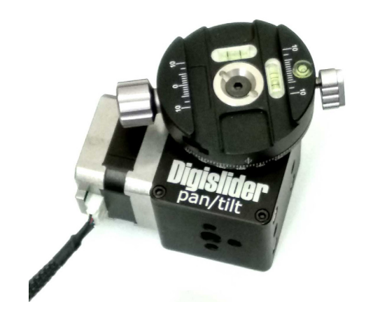
There are two locks on the panning head. The larger one is to lock the arca swiss plate, the smaller is to lock the panning unit. Clockwise to tighten. Make sure it is tightened when the motors are moving.