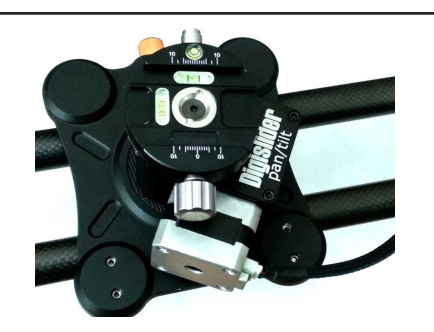
2. Screw on one of the Pan Tilt Units until it is tight.