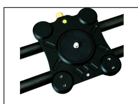
1. Take your slider