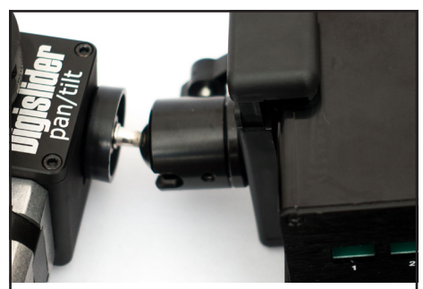
7. Attach the battery and controller side by side and mount it.