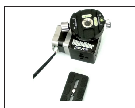
3. Get the second Pan Tilt Unit and one arca swiss plate