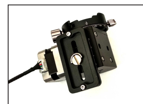
4. Fasten the plate to the back and lowest thread.