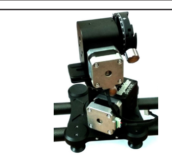
5. Attach the two units together.