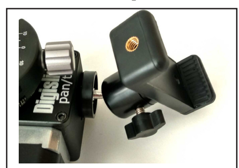
6. Fasten the Controller Mount