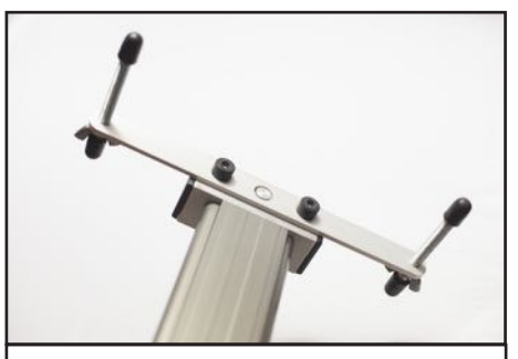
11. ...remove Thumb Screw and accessories as well as Rubber...