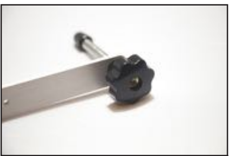
7. Screw on Leg Screw (8). Repeat 3 time.