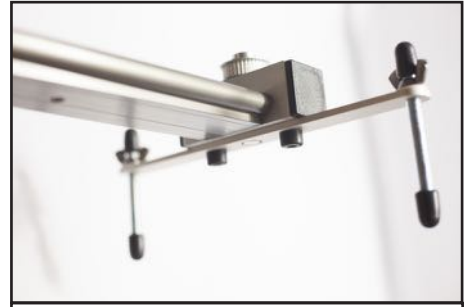
12. ...Grips from Pulley Box and use to attach to Pulley Box.