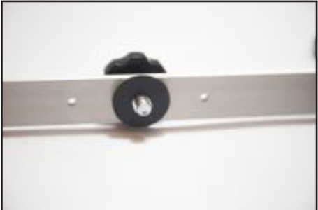
4. Place over Large Rubber Washer to secure, and repeat step 3.