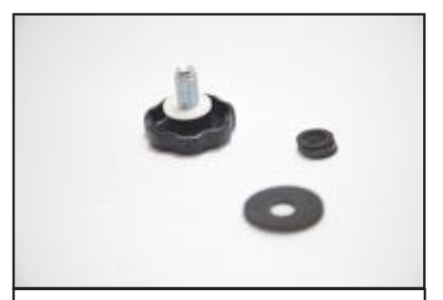
1. place large plastic washer (2.) over 3/8" thumb screw (4.).