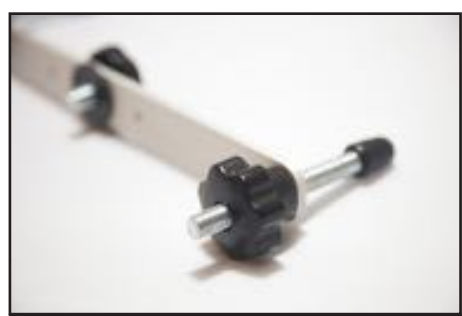
8. Loosen Leg Screw to adjust height. Tighten to secure.