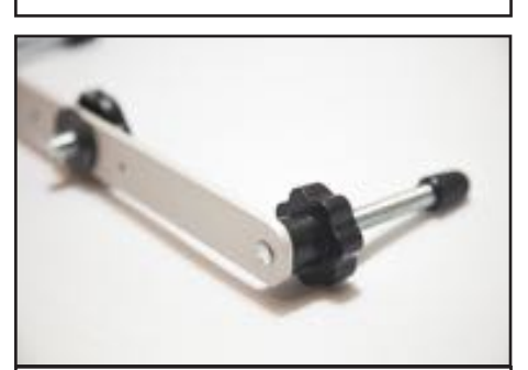
9. Alternative Leg Screw option.