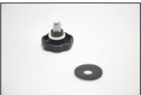
2. place 4 Small Plastic Washers(3) over and repeat steps 1 & 2