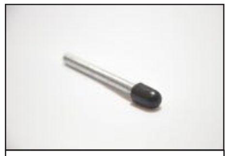
5. Twist 4 x Rubber Feet Grip (6) onto 4 x Leg Bar (7)