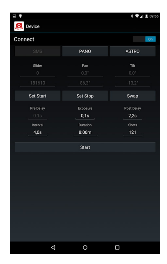
Select the delay, exposure, interval, duration and number of shots.