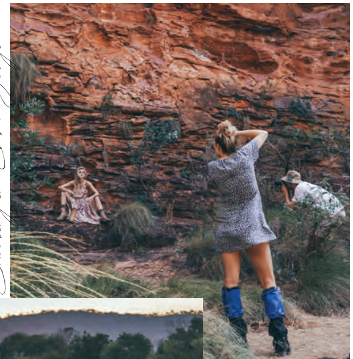
Shooting in Emma Gorge