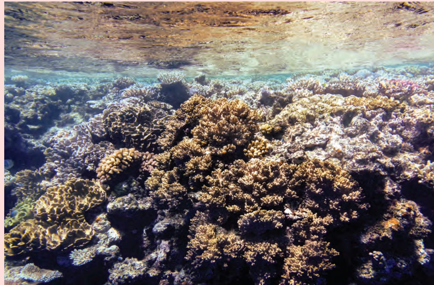
IMAGE CREDIT Great Barrier Reef, 2014

As serious ocean lovers, we're thrilled to now create our Spell swim from ECONYL® - an innovative Italian made fibre made from (amongst other things) thousands of tonnes of abandoned fishing nets, pulled from our seas.