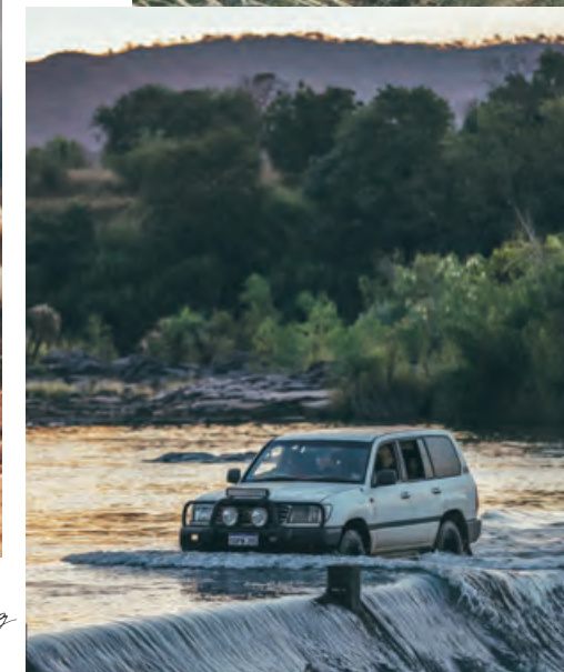
The Ivanhoe Crossing