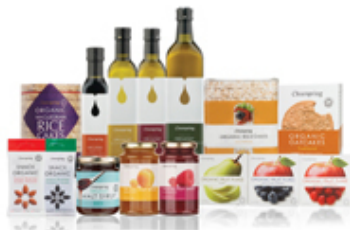
Organic Fine Foods