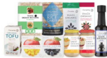
Free From Products