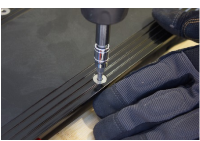
A1. Release 8 screws of foot deck.(by using H3 hex driver)