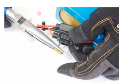
B1. Pickup the connector with fuse box labeled '6. Charge'. Then take out the fuse and check whether it is broken. If so please replace with a new one.