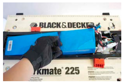
A3. Lift up the battery, then you will see all connectors connected to the battery.