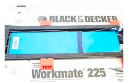
A2. Check the orientation of the battery. Barcode should be on the top.