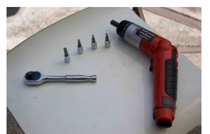
A0. Prepare the tools.