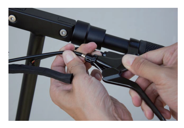
B4. Pull the brake lever away from the brake lever holder and make the brake pull wire go thru the side gap

B5. Once you take out the brake lever, you would see a red button inside the brake lever holder.