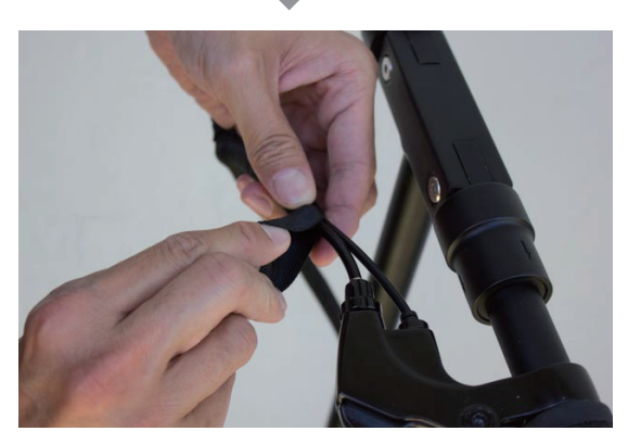
A1. Unwrap the cable wrap near the brake wire