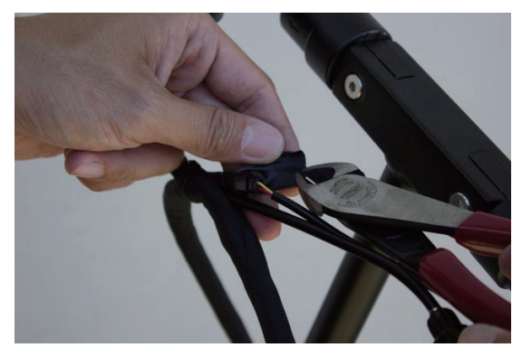
A2. Remove the heat shrink tube to access the connectors