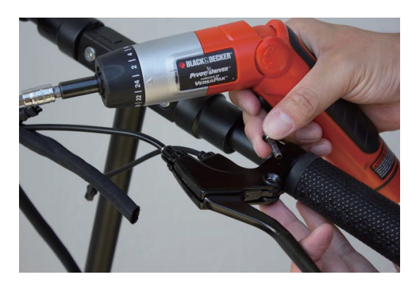
B2. Unscrew and remove the hex screw that hold the brake lever together on the holder