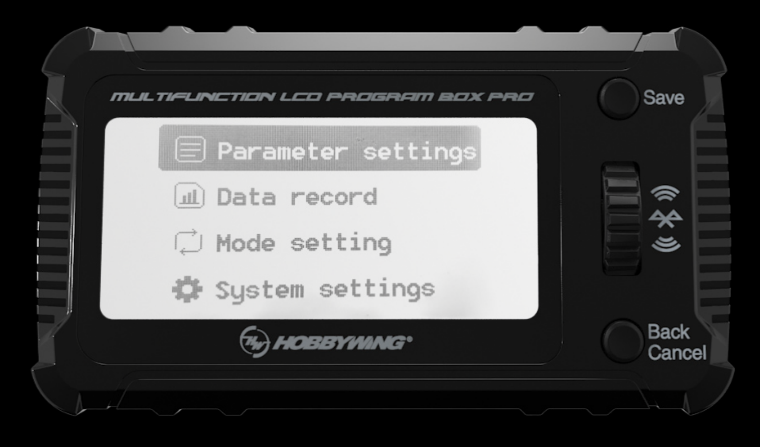
Supports <mark>3</mark> languages: JP EN Chinese, English, Japanese

Note: There are plans to expand even more languages support in the future.