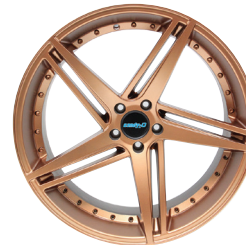
4334 Metallic Bronze tinted 15% per vol. with 4662 candy 2 O Dirt Track Brown

Airbrushing: 4200 Series Colors work best for airbrush colors. Dilute generously with a mix of both 4030 Balancing Clear and 4012. Generally, an equal mix of paint / 4012 / 4030 Balancing Clear works well. Exact ratios are not required, what is important is atomization. Add enough 4012 to achieve optimum atomization with each color.