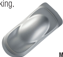
6013 AutoBorne Silver Sealer