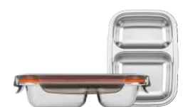
PARTITION RECTANGLE NO. 3

L 183 x W 129 x H 45 capacity 370 mL | weight 212 g