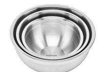
MIXING BOWL (3 SET)

L 303 x W 303 x H 122 capacity 4,000 mL | weight 635 g