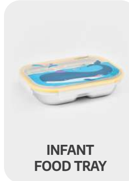
INFANT FOOD TRAY

L 95 x W 95 x H 205 capacity 250 mL | weight 356 g