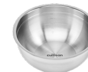
MIXING BOWL (XL)

L 262 x W 262 x H 114 capacity 3,000 mL | weight 502 g