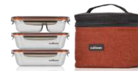
TOGO FLORA L SET NO. 2

PARTITION RECTANGLE No.3 L 220 x W 157 x H 50 capacity 700 mL | weight 336 g