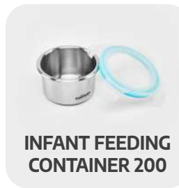
INFANT FEEDING CONTAINER 200