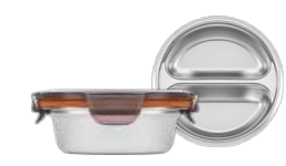
PARTITION ROUND NO. 1

L 125 x W 125 x H 47 capacity 150 mL | weight 133 g