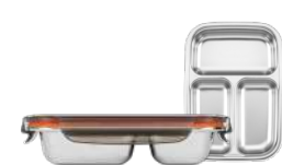
PARTITION RECTANGLE NO. 3-1

L 220 x W 157 x H 50 capacity 700 mL | weight 336 g