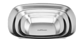
RECTANGLE PLATE (3 SET)

L 245 x W 245 x H 47 capacity 1,700 mL | weight 467 g