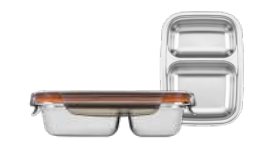
PARTITION RECTANGLE NO. 2

L 149 x W 109 x H 45 capacity 220 mL | weight 161 g