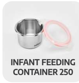
INFANT FEEDING CONTAINER 250

L 95 x W 95 x H 180 capacity 200 mL | weight 333 g