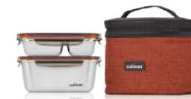
TOGO FLORA L SET NO. 1

PARTITION RECTANGLE No.2 L 183 x W 129 x H 45 capacity 370 mL | weight 212 g