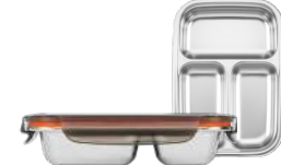
PARTITION RECTANGLE NO. 4-1

L 260 x W 192 x H 55 capacity 1.0 L | weight 434 g