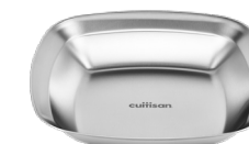
RECTANGLE PLATE (L)

L 195 x W 195 x H 46 capacity 800 mL | weight 291 g