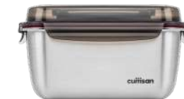
FLORA HANDY NO. 3

L 260 x W 192 x H 119 capacity 2,800 mL | weight 558 g