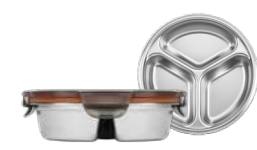
PARTITION ROUND NO. 2

L 125 x W 125 x H 47 capacity 150 mL | weight 133 g