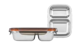
PARTITION RECTANGLE NO. 1

L 155 x W 155 x H 47 capacity 280 mL | weight 192 g