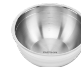
MIXING BOWL (L)

L 222 x W 222 x H 100 capacity 2,000 mL | weight 353 g