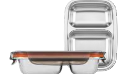
PARTITION RECTANGLE NO. 4

L 220 x W 157 x H 45 capacity 560 mL | weight 322 g