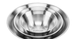
ROUND PLATE (3 SET)

L 210 x W 210 x H 43 capacity 870 mL | weight 221 g