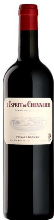
Merlot Cabernet Sauvignon

Case 6 €135 (excludes VAT & Duty) Delivery spring 2025