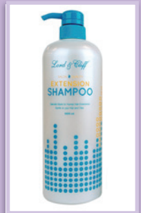
Hair Essence L&C Shampoo