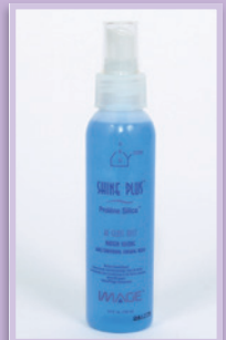
Shine Plus Shampoo Shine Plus Hi-Gloss Mist