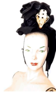
DEADWOOD WIDOW HAT