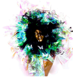
ELECTRIC LOTUS HOOD