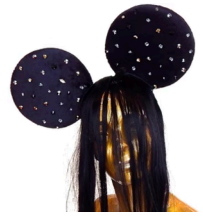
HESHER MOUSE HEADBAND