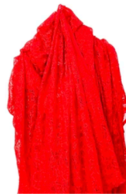
BLOODY SUNDAY MANTILLA