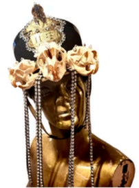
GLASGOW GRIN HAT