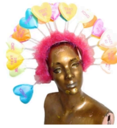
CRAZY HEARTS HEADBAND