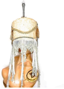
DANGEROUS LIAISONS HAT