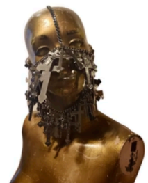
CONFESSION HEAD CHAIN