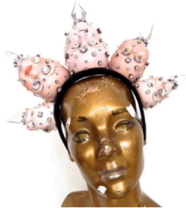
BILLION DOLLAR BABY HEADBAND