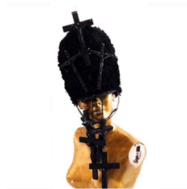
JUDAS MARCHING BAND HAT