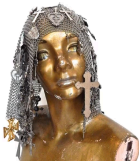
CONFESSION CHAIN HEADPIECE