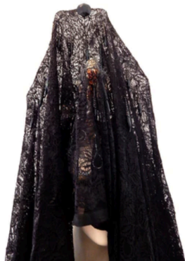
GLASGOW GRIN MANTILLA