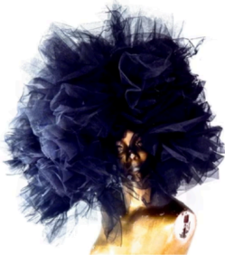
BLACK SWAN HEADBAND