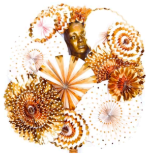
GOLDEN GARDEN PARTY HEADPIECE