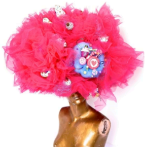
CAKE QUEEN HAT