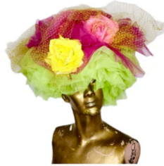
ELECTRIC HOLLY GO LIGHTLY HAT