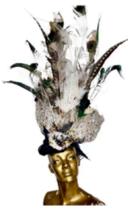
DIVINE CONDOR FASCINATOR