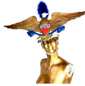
GENERAL FALCON HAT