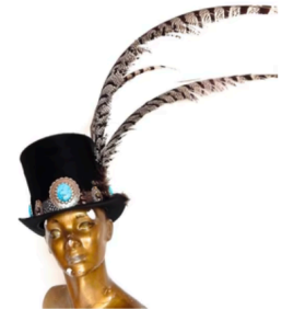
BULLOCK TOP HAT