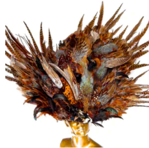
BIRDS OF PREY HAT