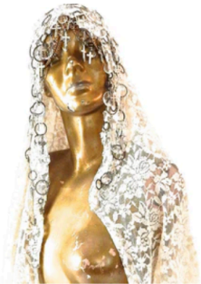
FORTUNE TELLER VEIL