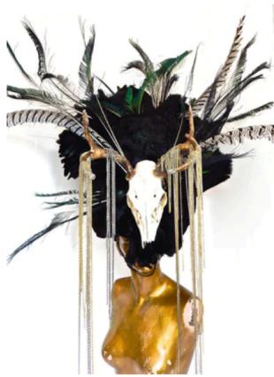
BEAST OF THE WILD HAT