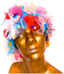
CARNEY SWIM CAP