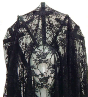
JUDAS LACE MANTILLA