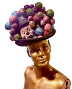
CLOWNY TOP HAT