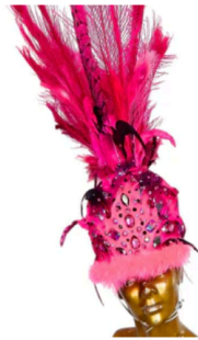
HOT PINK REBELLION SHAKO HAT