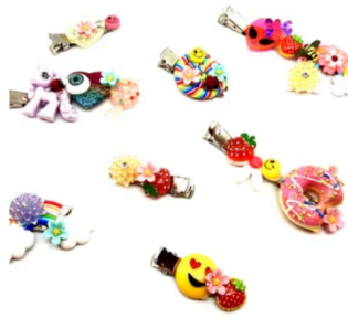
CARNEY HAIR CLIPS