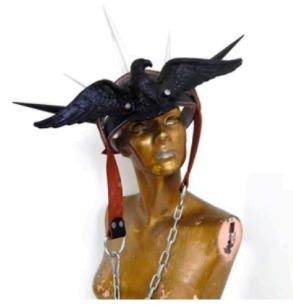
ASYLUM SPIKE HEADPIECE