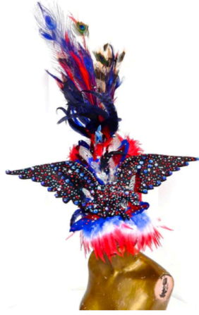
AMERICAN REBELLION SHAKO HAT