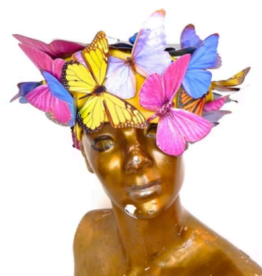
BUTTERFLY KNIFE BERET