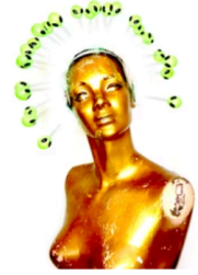
FORBIDDEN MARTIAN HEADBAND