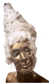
DOVE TAIL HEADBAND