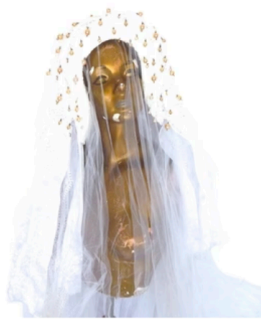
DYNASTY PEARL VEIL HEADDRESS