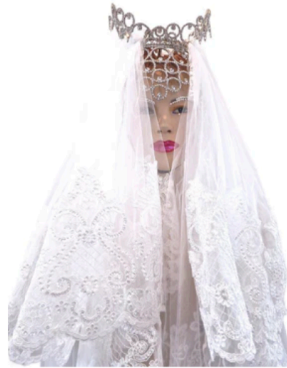
IMPERIAL BRIDE CROWN VEIL