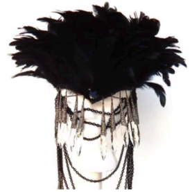
BLACK SWAN HAWK DRIP