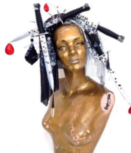
DEATH WISH HEADPIECE