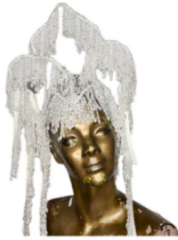
DANGEROUS LIAISONS HEADPIECE