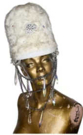
CAPULET MARCHING BAND HAT