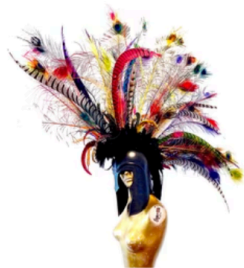
GLORY WARRIOR MOWHAWK HELMET