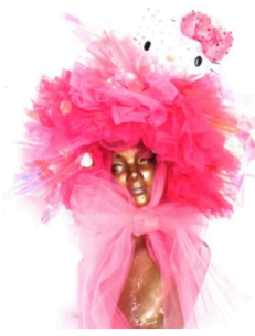
HELLO KITTY PUSSY BOW HEADBAND