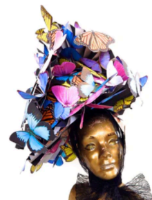
BUTTERFLY KNIFE HAT