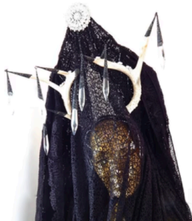
DEATH DEALER HEADPIECE