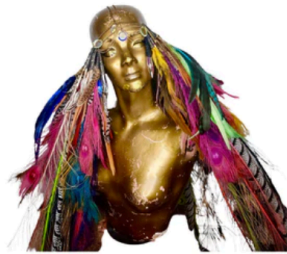
CARNIVAL FEATHER HEADCHAIN