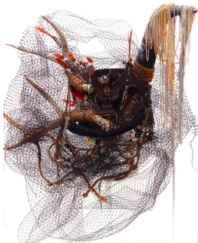
BUTCHER TOP HAT