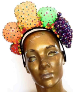
FRUIT PUNCH HEADBAND