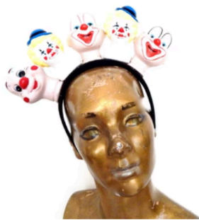
CLOWN QUEEN HEADBAND