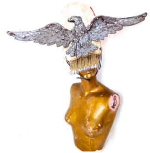
GOLDEN FALCON HAT