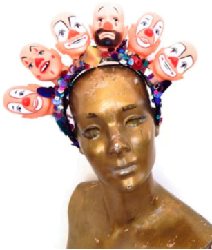
CLOWN LOVE HEADBAND