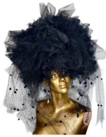
HOLLY GO LIGHTLY HAT