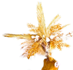
GOLDEN BEAST HAT