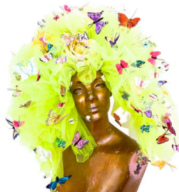
BUTTERFLY EMPIRE HEADPIECE