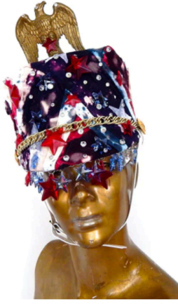
AMERICAN OUTLAW HAT