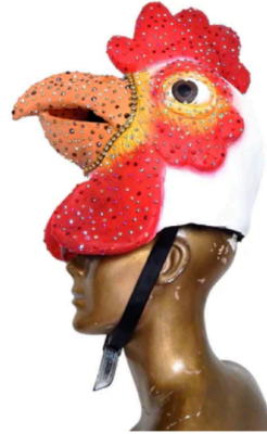
CHICKEN FAT HAT