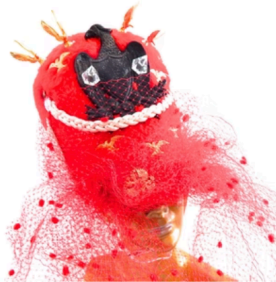
BLOOD MARCH HAT