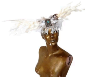
COYOTE FEATHERS HEADPIECE