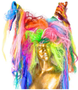
ELECTRIC DAISY HEADDRESS