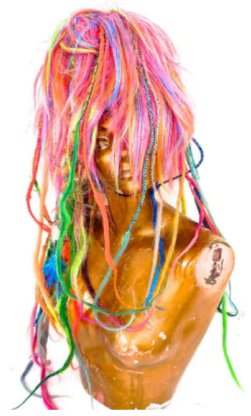
ELECTRIC DAISY HAT