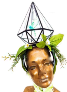
HUMMINGBIRD MAGIC HEADBAND