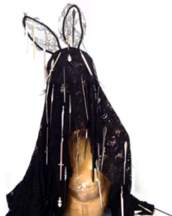
DEATH LETTER HEADPIECE