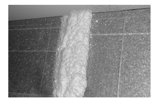
FIGURE 1—DUCT JOINT SEALING