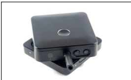
Switching Active Chamber