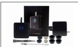
Haze Square Full Kit

Square to heat to desired temperature and to maintain heat consistency).