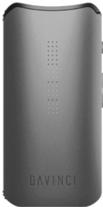
IQC shown in Smart Path 3