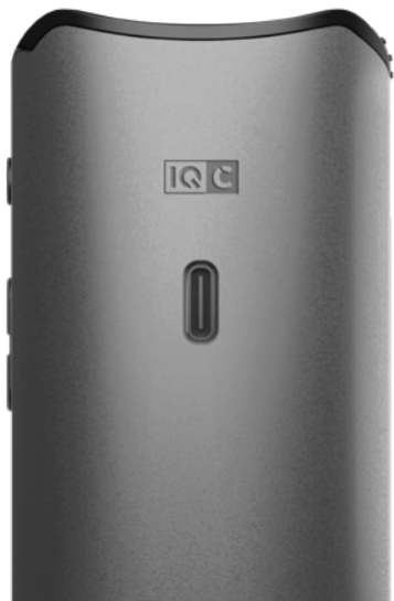
IQC showing USB-C Port