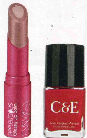
Crabtree & Evelyn Nail Lacquer in "Apple"; $6, crabtree-evelyn.com .

NYC Cosmetics Applicable Glossy Lip Balm; $2.99, mass market retailers.