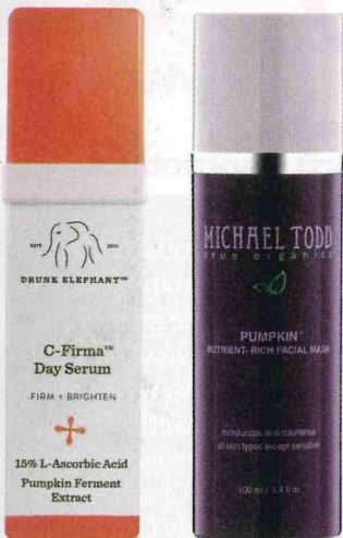
Michael Todd Pumpkin Nutrient-Rich Facial Mask; $34, michaeltoddtrueorganics.com .

Drunk Elephant C-Firma Day Serum with Pumpkin Ferment Extract; $80, drunkelephant.com .