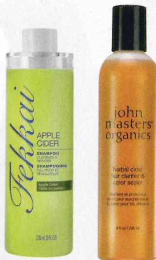
John Masters Organics Herbal Cider Hair Clarifier & Color Sealer; $17, johnmasters.com .

Fekkai Apple Cider Shampoo; $19.99, Frederic Fekkai Salons and fekikai.com .