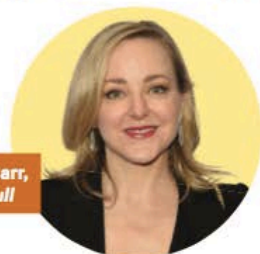
Geneva Carr, CBS’s Bull

“I have very sensitive skin, so I love Josie Maran’s organic product line. She’s making natural products hip.”