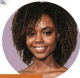
Ashleigh Murray, The CW's Riverdale

“My favorite leave-in conditioner right now is from a natural line called Oyin Handmade. It smells like cake batter.”