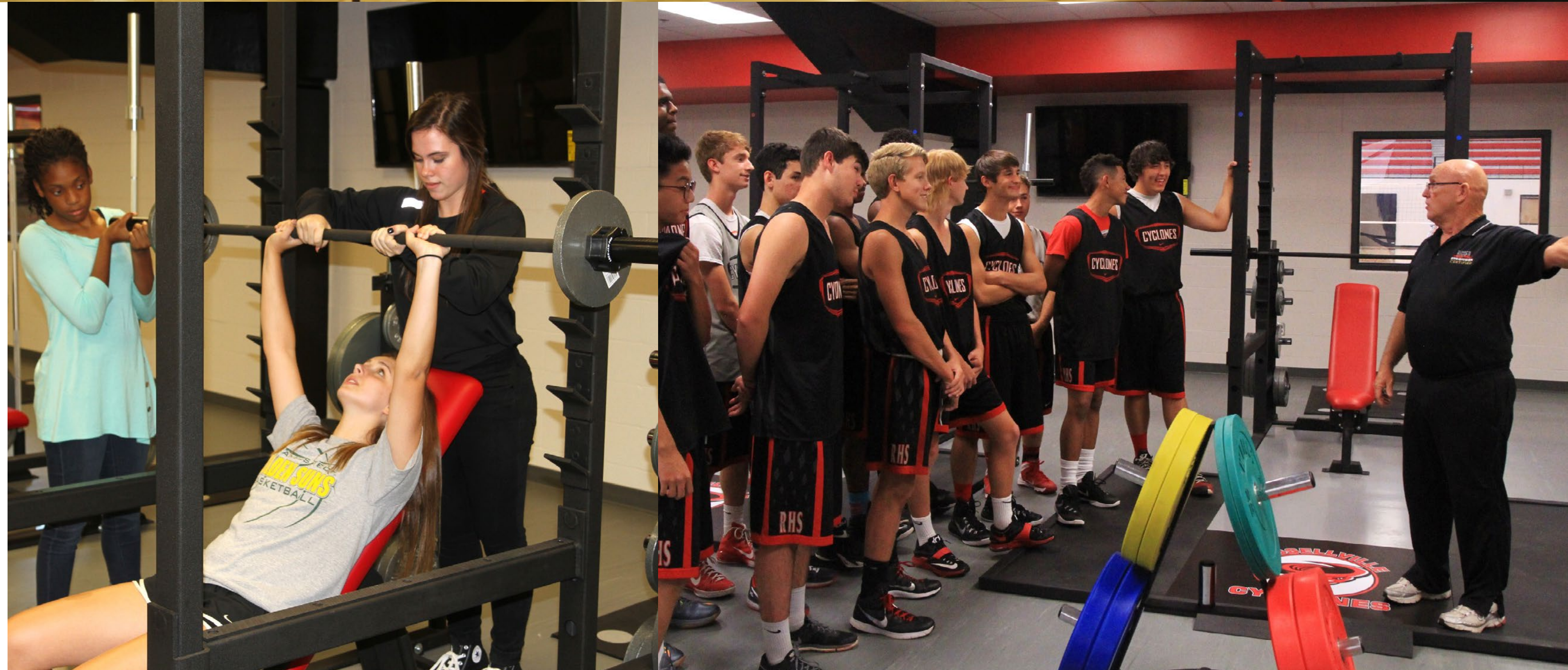
The Cyclone Arena serves both boys and girls sports with facilities for training and for gameday!