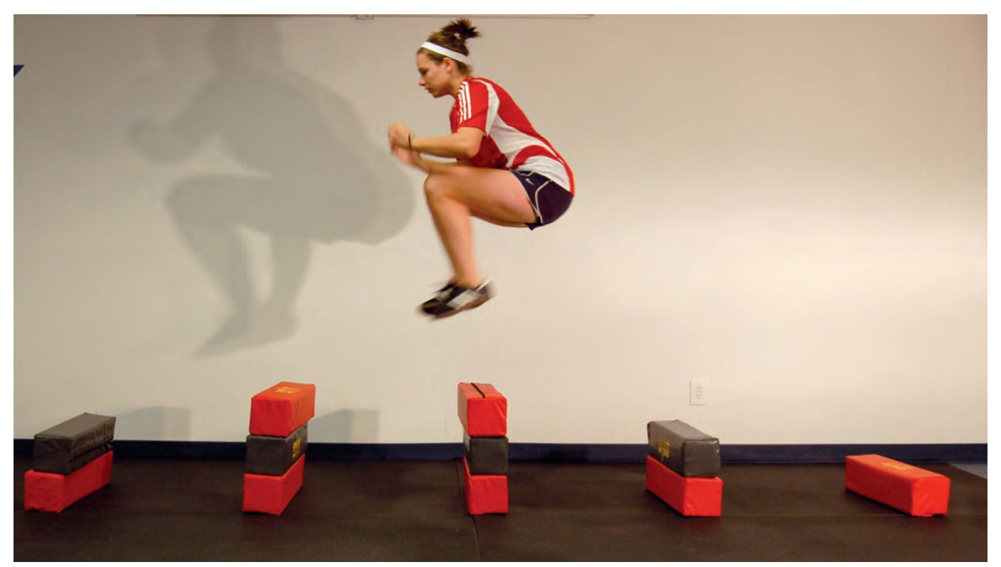
Jump training, such as shown here with variations of horizontal and vertical jumps, is key to improving athletic performance in nearly every sport.