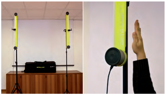
The OptoJump can duplicate the traditional vertical jump testing, and also provides a "Drift Protocol" to determine an athlete's dynamic stability.