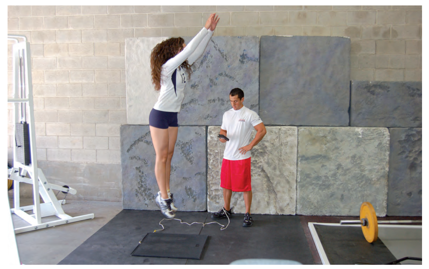
Vertical jump testing on a force platform, such as shown here with the BFS Just Jump system, was a marked improvement over previous methods of jump testing.

Until recently, the following has been the evolution of vertical jump testing: the Sargent Jump Test performed on a wall, a pole device with plastic tabs, and a force platform. The next stage of evolution is the OptoJump<sup>TM</sup>.